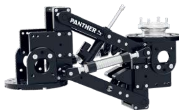
Mini Shock Absorber (313606)