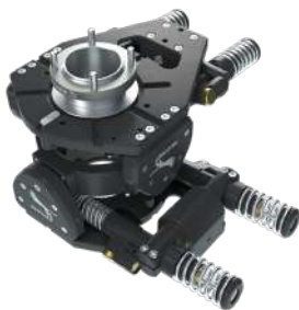
ISO Dampener Pro (312009)

The Tower 2 can be combined with a huge range of accessories like for example a Mini/Maxi Shock Absorber and ISO Dampener for maximum horizontal and vertical smoothness. All standard camera mounts are supported as well: