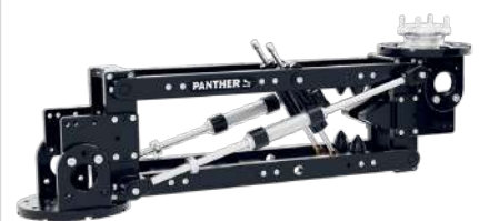
Maxi Shock Absorber (313607)